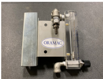
Optional Flow Meter